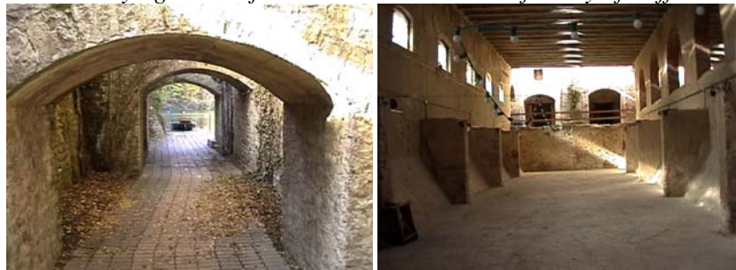
The drying sheds of the old lime and cement factory of Beffes

The Berry canal is now entirely passable in the Pays Loire Val d'Aubois (fifty kilometres). This waterway is essential for the development of hiking in the Pays.