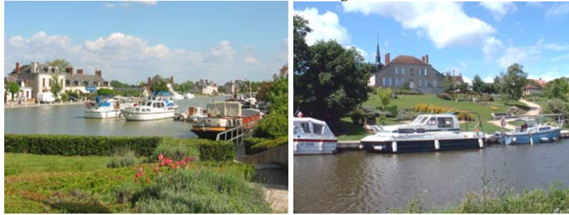
The lateral canal along the Loire

Others operations doesn't start again as the tilery of La Guerche sur l'Aubois with a project of arrangement conciliating culture and preservation of a remarkable heritage, as the old metalworks of Torteron, a site basically enhanced by taking advantage of the illumination of the old ruins and the creation of "industrial romantic gardens".