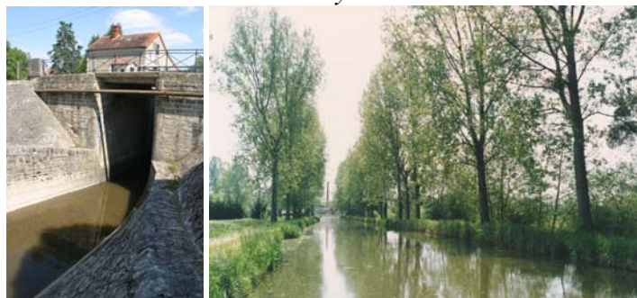
The Berry canal

The Berry canal is now entirely passable in the Pays Loire Val d'Aubois (fifty kilometres). This waterway is essential for the development of hiking in the Pays.