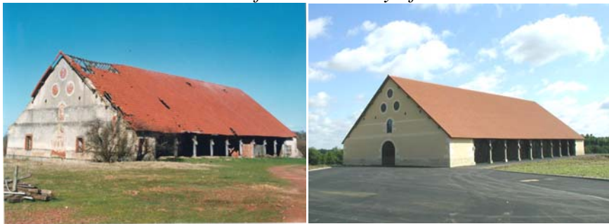
The coal shed of the old smithy of Grossouvre

The drying sheds of the old lime and cement factory of Beffes, open during the heritage days, are used to organize shows. The old quarry, full of water, becomes a diving center.