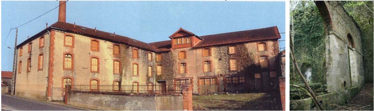
The tilery of La Guerche sur l'Aubois and the ruins of the old metalworks of Torteron

Others operations doesn't start again as the tilery of La Guerche sur l'Aubois with a project of arrangement conciliating culture and preservation of a remarkable heritage, as the old metalworks of Torteron, a site basically enhanced by taking advantage of the illumination of the old ruins and the creation of "industrial romantic gardens".